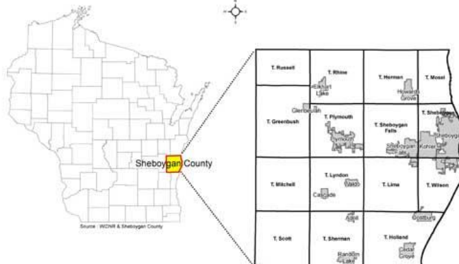
Sheboygan County, WI